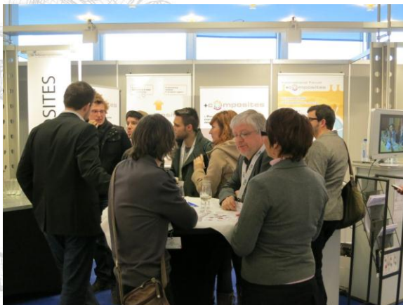
Métamorphose 2013 - Liège, January 2013

These meetings have enabled many companies to initiate the process of technology transfer, accompanied by +Composites project partners.