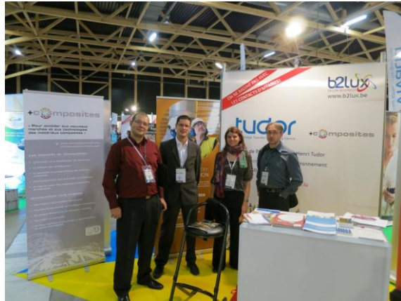
B2Lux - March, November 2013