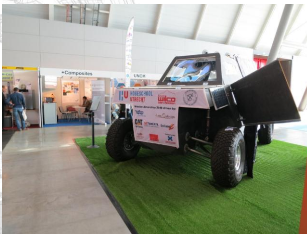
Composites Europe 2013 - Stuttgart

In the second half of the year, we took part in Composites Europe 2013 in Stuttgart, in the composite materials and automotive fair at the Salon à l'Envers in Thionville, then in Aérodatings 2013 in Yutz, which was dedicated to industrial companies in aeronautics.