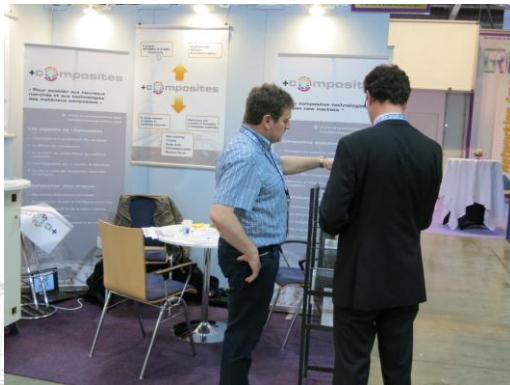
The Saarland partner, INM - Kirchberg, June 2013

This year's event saw the participation of 178 exhibiting companies and 2,350 visitors.