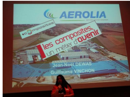
Job-training seminar - Saint Quentin, February 2013

But more than our participation in major regional and international events, +Composites has been active in the field, organizing events such as professional seminars on topics including additive techniques and 3D printing, machining and assembly, non-destructive testing, thermal and mechanical characterization of composites as well as the topics of eco-design, markets and challenges in the use of composites, the financing of innovation and finally training and employment.